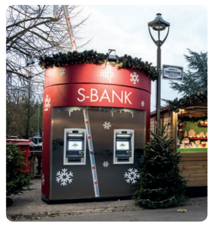
Mobile automated teller machine