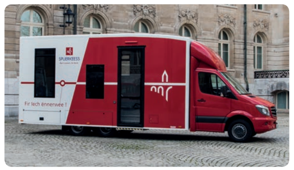
Mobile bank branch