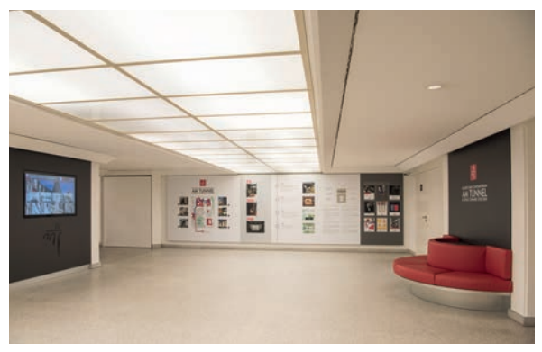
Contemporary art gallery "Am Tunnel"